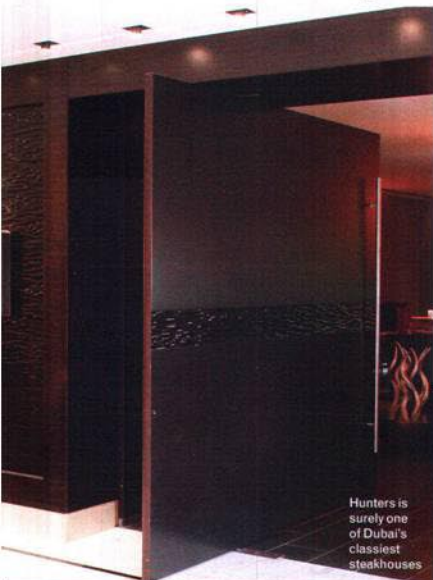
Hunter's is surely one of Dubai's classiest steakhouses

*STK, Thursdays at MED, Media One Hotel, 04 427 1000