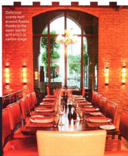
Delicious scents waft around Asado thanks to the open 'parilla' grill which is centre-stage

★Asado, The Palace – The Old Town, 04 428 7888