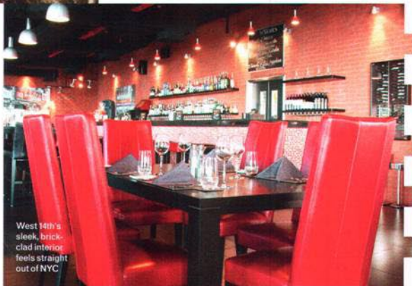
West 14th's sleek, brick-clad interior feels straight out of NYC

West 14th, Oceana Beach Club, The Palm Jumeirah, 04 447 7601 ▶